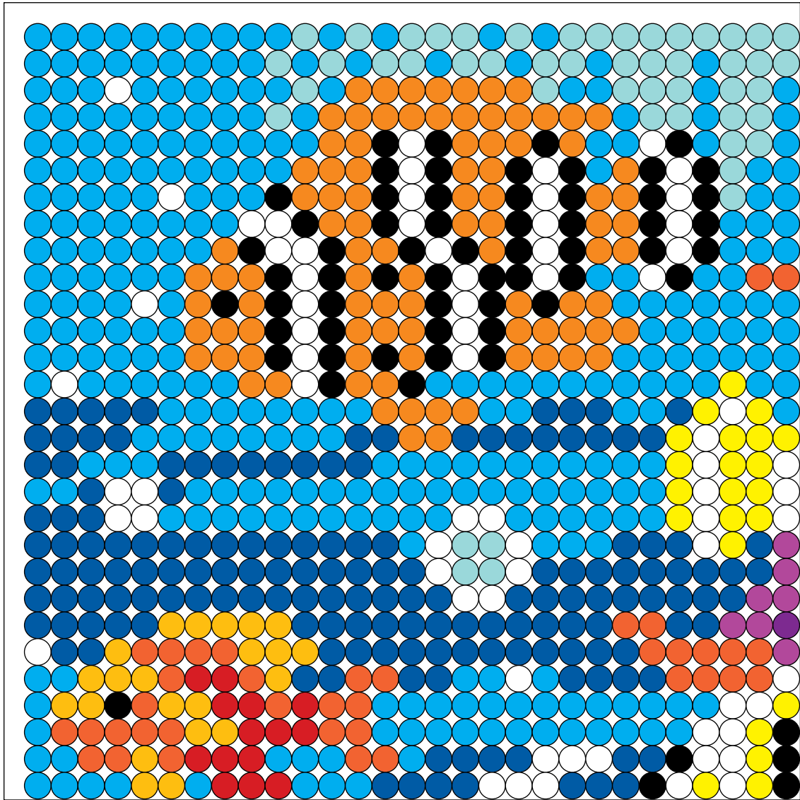
Upper left quadrant